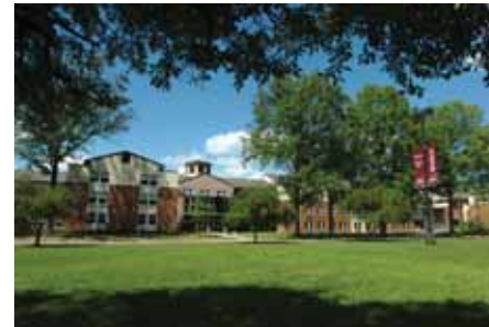
New Residence Hall