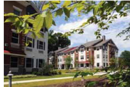
West Village A&B