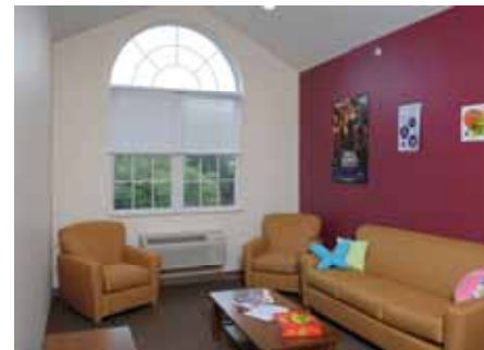
West Village Sitting Room

For questions or more information please contact Conference Services at 609-896-7700.